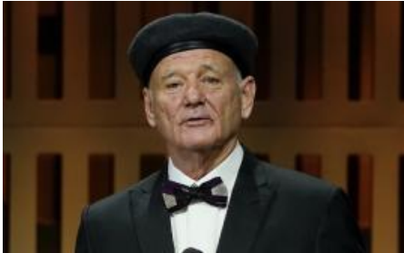
Bill Murray Gives First Comments on Inappropriate Behavior Complaint: 'It's Been Quite an Education for Me'