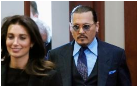
Johnny Depp Was to Receive $22.5 Million for 'Pirates 6,' Agent Says