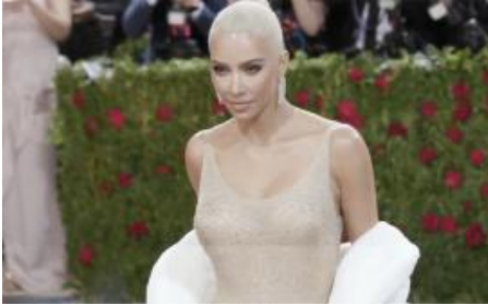
Kim Kardashian Wears Iconic Marilyn Monroe 'Happy Birthday' Dress to Met Gala