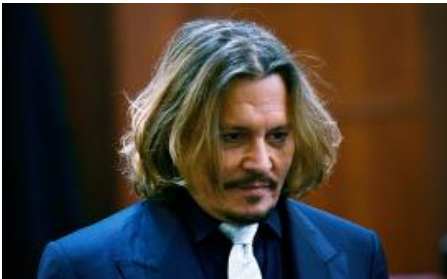
Johnny Depp Trial Reveals Sordid Culture of Celebrity Enablers