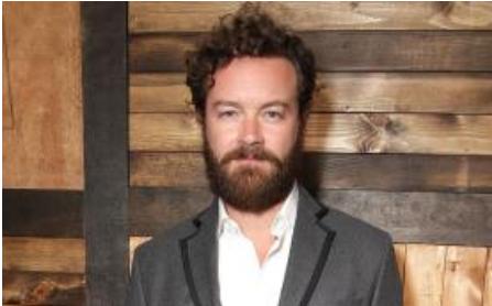
Church of Scientology Seeks to Undo 'Sweeping' Ruling in Danny Masterson Case