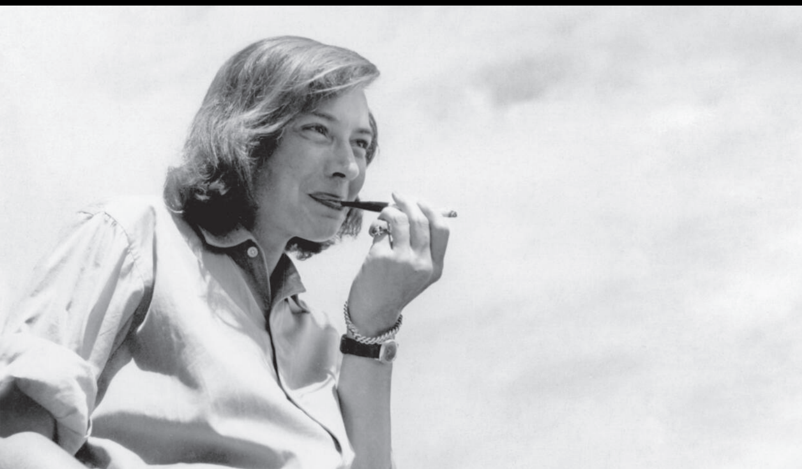
Image taken from «Loving Highsmith», directed by Eva Vitija © Madman Films