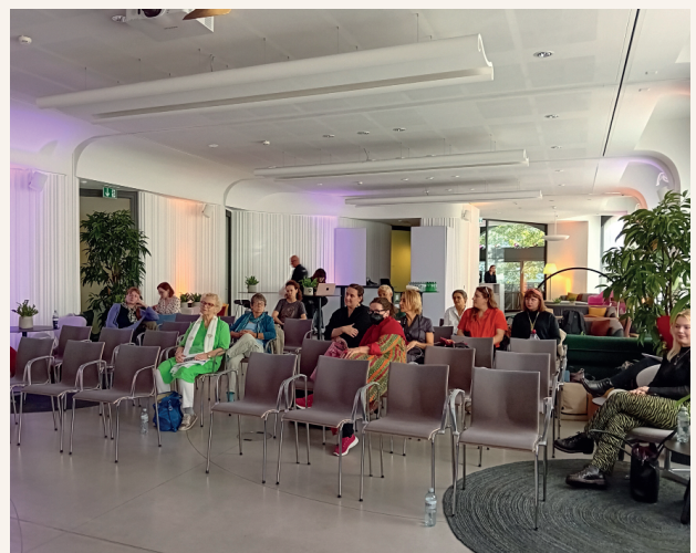
Members attending the Extraordinary General Assembly