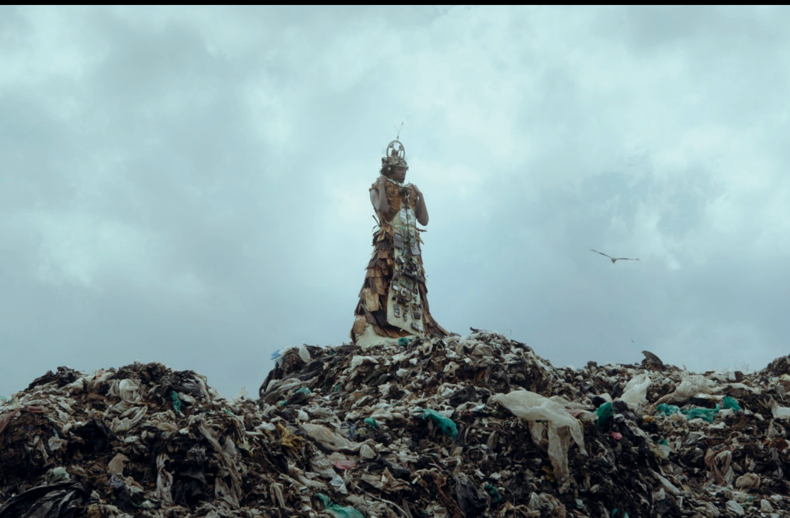
Image taken from «Terra Mater», directed by Kantarama Gahigiri