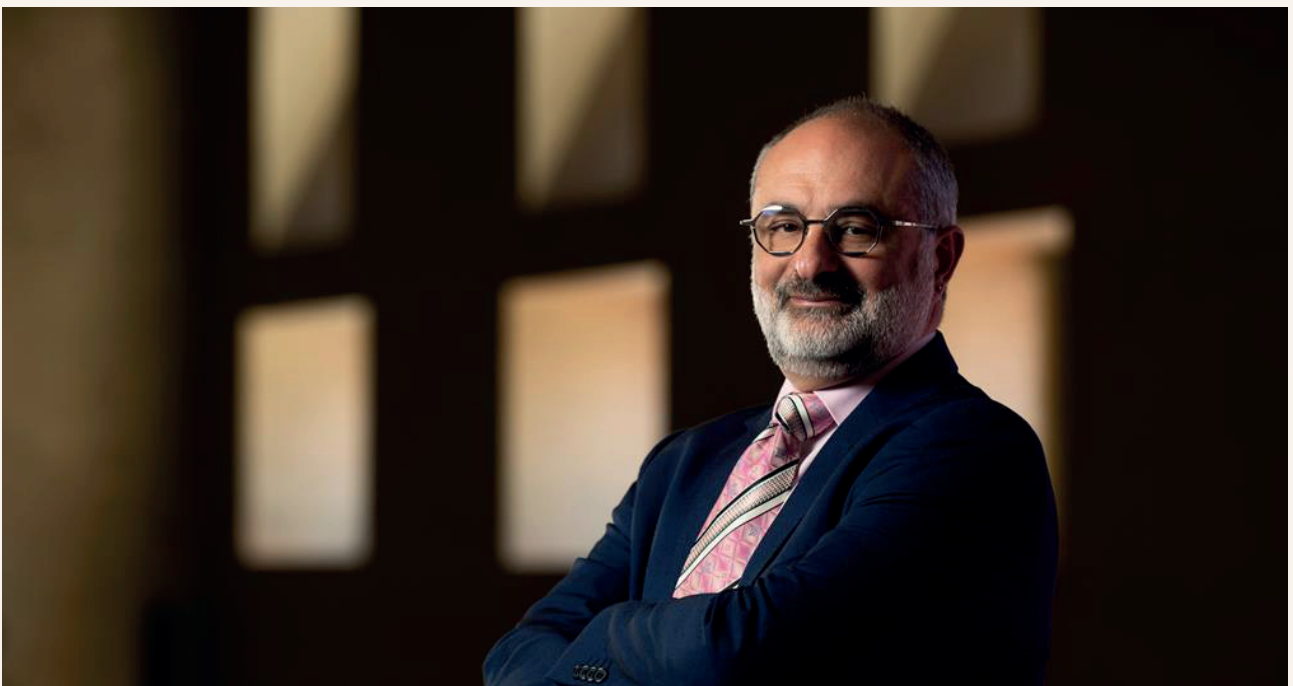
Locarno Film Festival's artistic director Giona A. Nazzaro