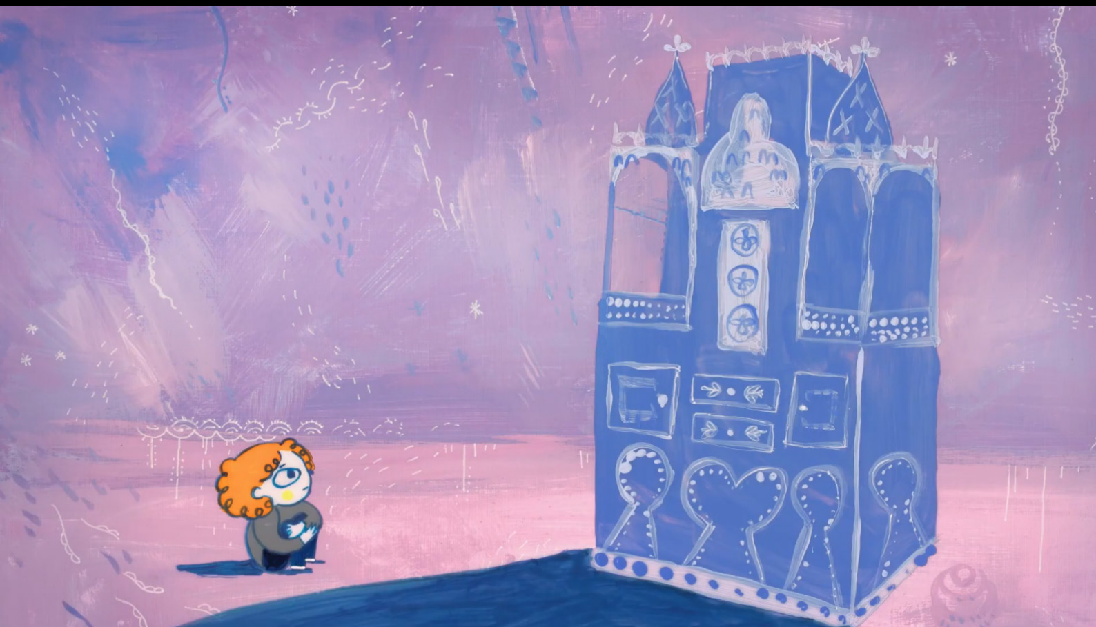
Image taken from "Armat", directed by Élodie Dermange