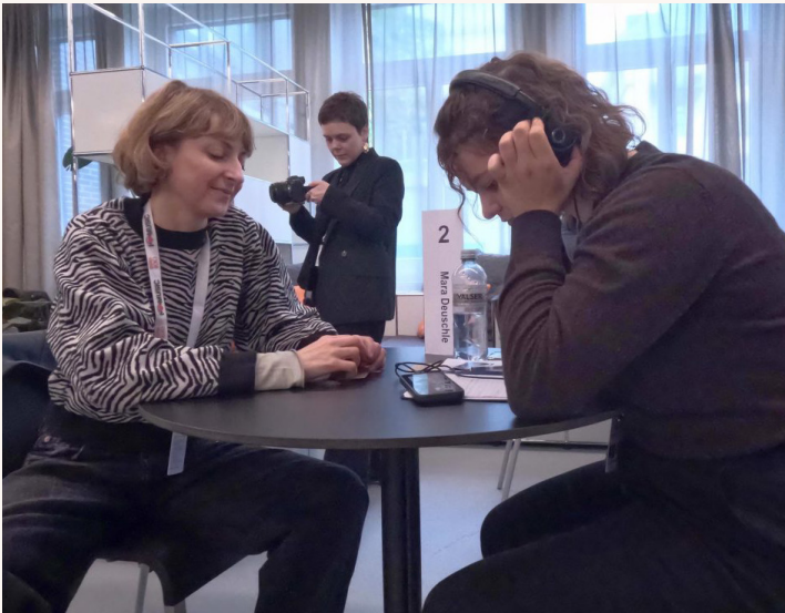
Participants to the matchmaking event

In 2024, SWAN continued its annual collaboration with SoundTrack_Zurich on two events. The first event was Matchmaking for Women in Media & Music, where female professionals working in sound get to meet female directors, producers and other film professionals for a 10-minute speed met. It took place at Publicis, on October 4, 2024.