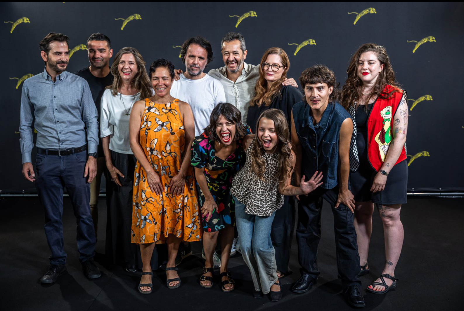
The cast and crew of "Reinas", directed by Klaudia Reinicke