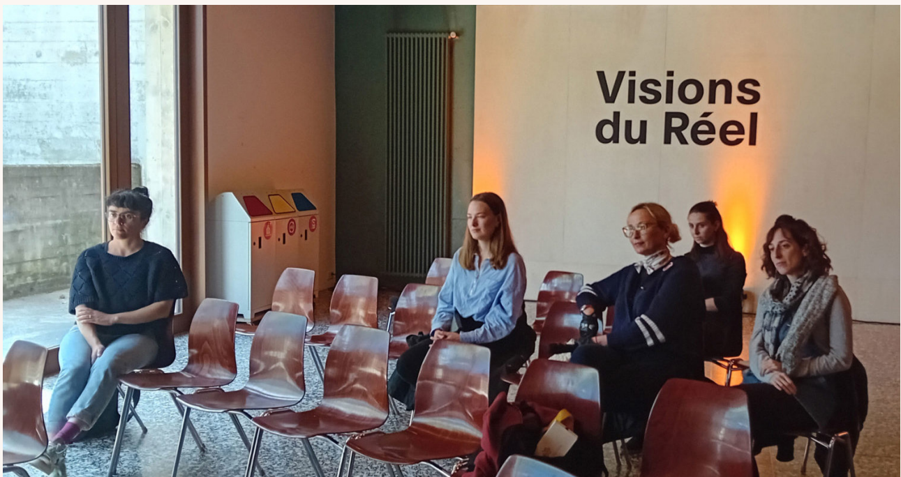
Members attending the 2024 General Assembly