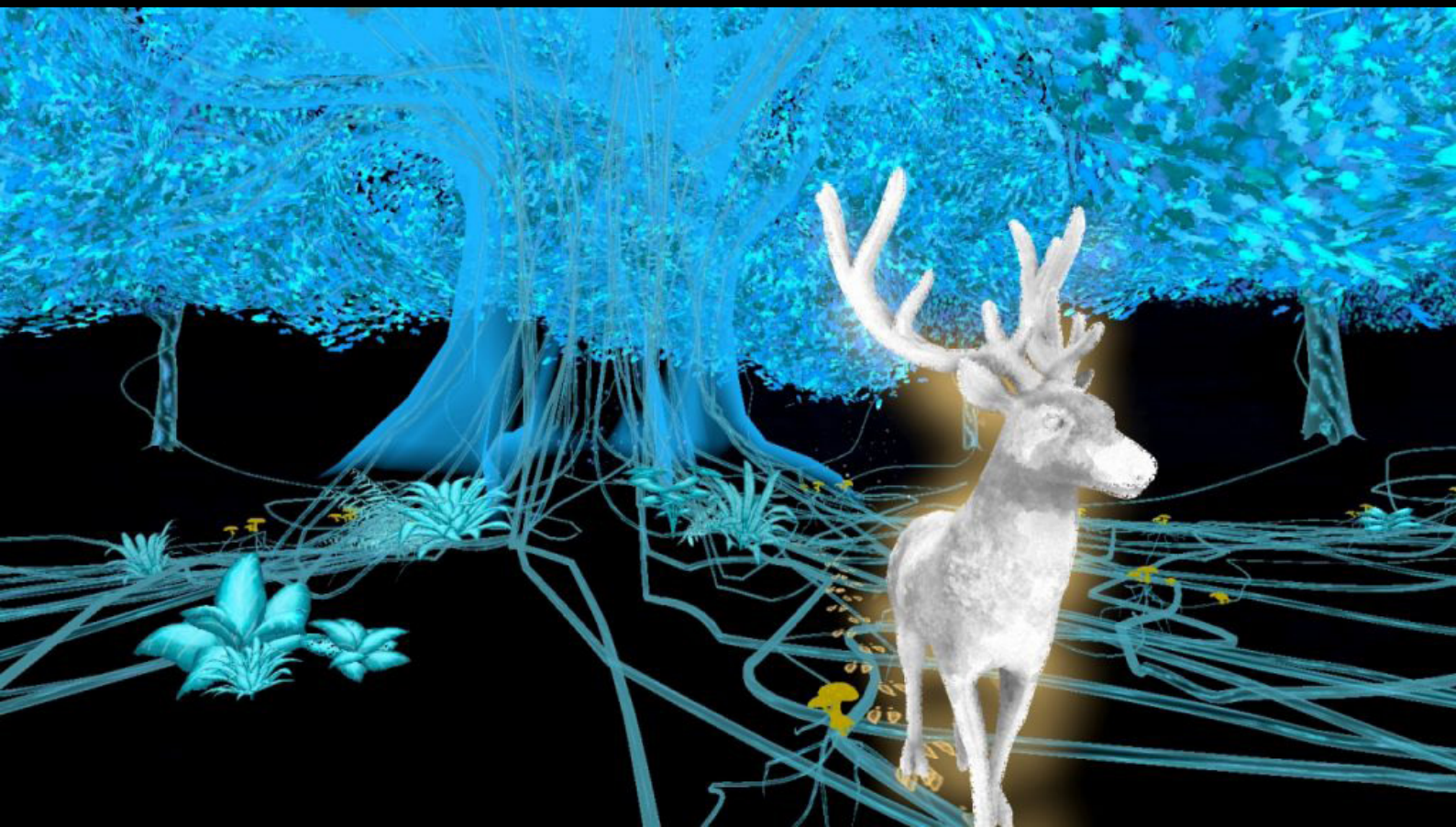
Image taken from VR immersive animation "Bloom", directed by Fabienne Giezendanner and Franck Van Leeuwen